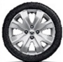
15" Decade Hubcaps