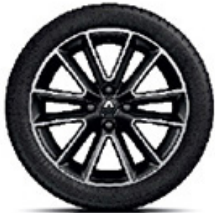
16" Altica Black Diamond Alloy Wheels