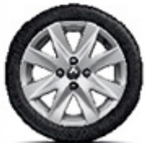
15" Symphonie Alloy Wheels