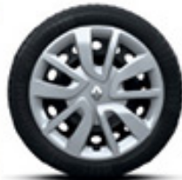
15" Magiceo Hubcaps