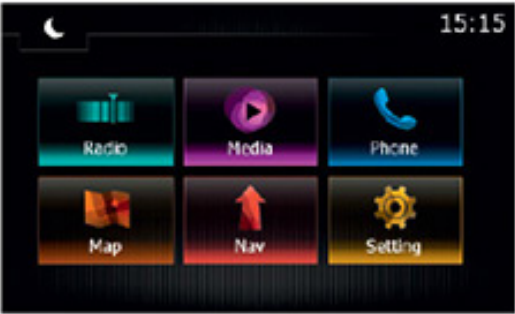
Media Nav 2.0 Multimedia System